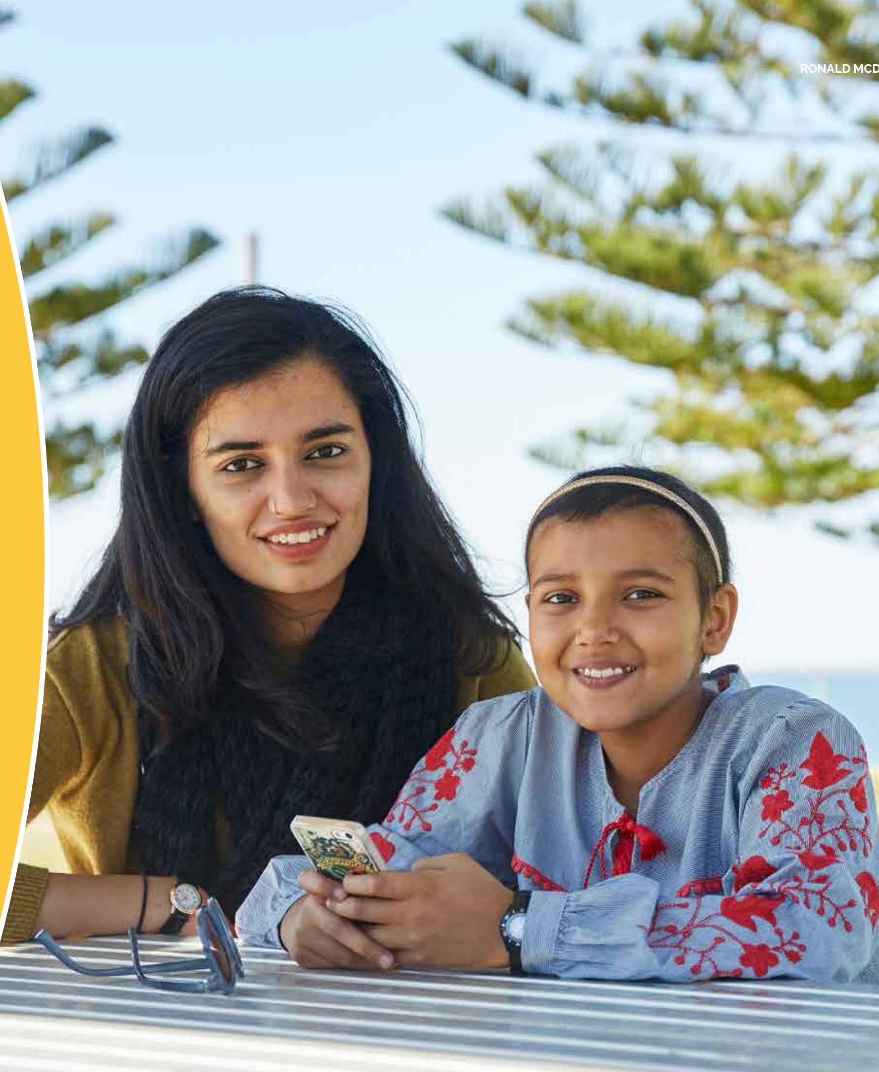
ALD MCDONALD HOUSE CHARITIES ANNUAL IMPACT REPORT 2017

"It was an opportunity for her to just be a normal child for once, to do things normal kids do."